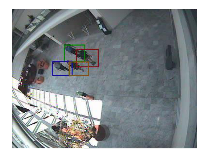
Fig. 2: An image from CAVIAR dataset and the bounding boxes drawn by the tracker.